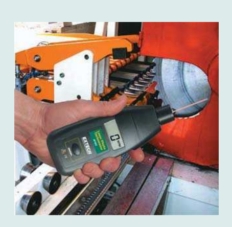
Laser light source for use on machinery where access is limited and accurate measurements at long distances are needed